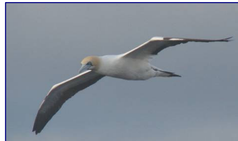
Cape Gannet