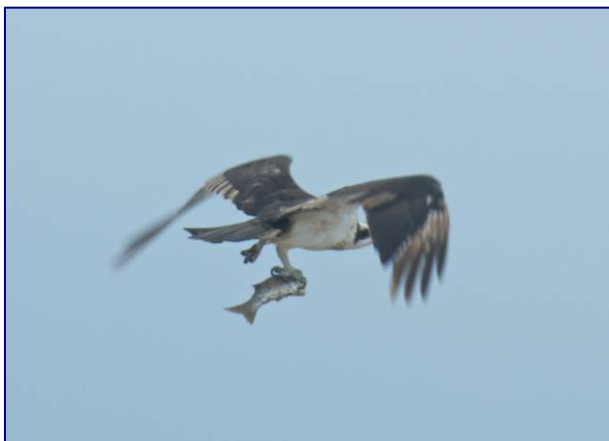
Walvis Bay's Osprey is still being seen regularly