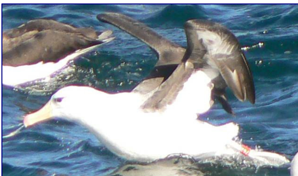
Black-browed Albatross – note red darvic ring on left leg

8/7/08: I recently managed to photograph a ringed Black-browed Albatross +/- 140km SW of Walvis. Other interesting birds on the trip included 3 Spectacled Petrels, 2 Wandering Albatrosses and what was probably an Antarctic Prion. The following mail is the reply from Andy (British Antarctic Survey/BAS) who ringed the bird.