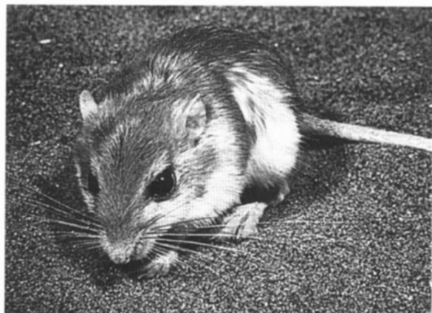
FIG. 1. Gerbillurus tytonis .

ONTOGENY AND REPRODUCTION. Reproduction and recruitment into the G. tytonis population occurs in summer. On the northern fringe of the central Namib Desert dune system at